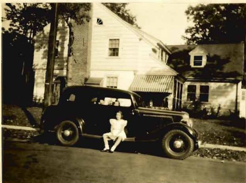
The house and the car.