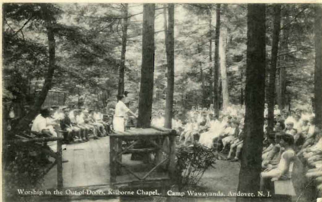
Worship in the Out-of-Doors, Kilborne Chapel, Camp Wawayanda, Andover, N. J.

Another great thrill was when I swam across the lake. This made me eligible for Canoe Instruction.