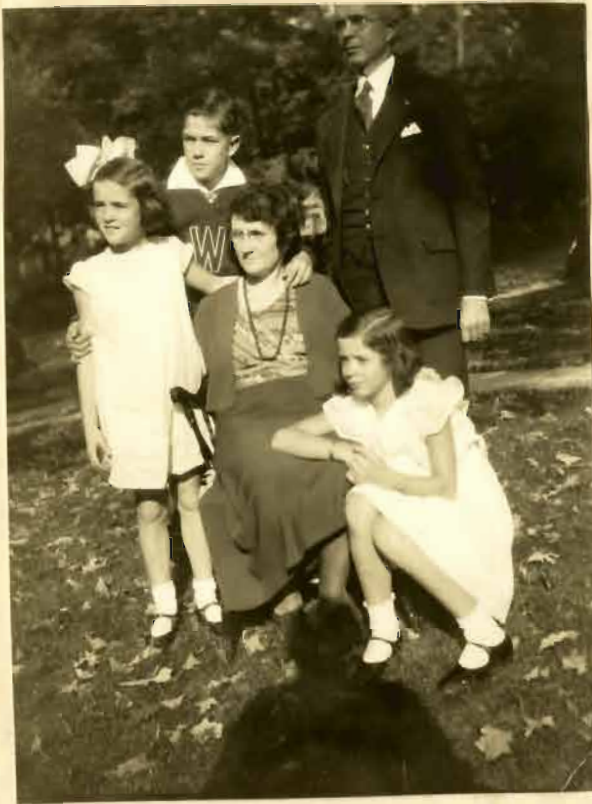
The Members of my Family