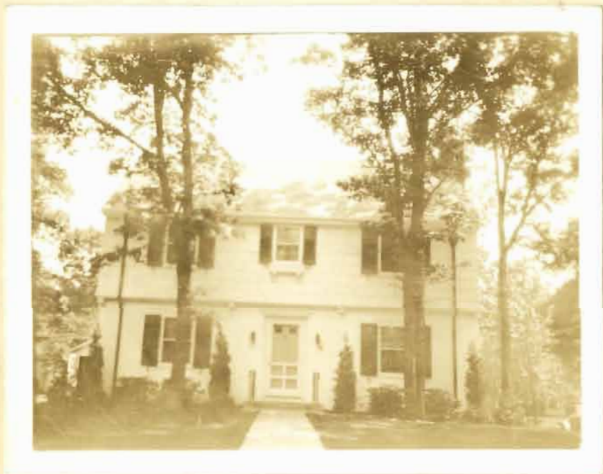
My Present Home

We began to think about building. With an architect, we made plans, and