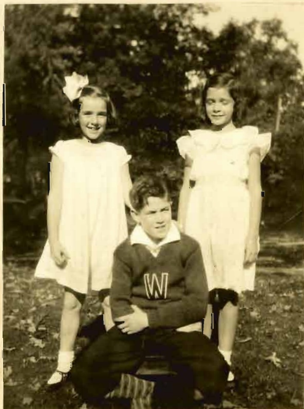
My two sisters and myself.